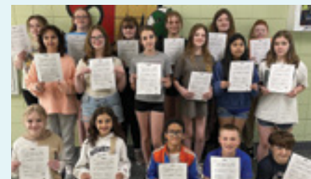
Choral students at Gerrardstown's Mountain Ridge Middle School with new sheet music donated to the school by Friends of Music.

With the ongoing assistance of local businesses and foundations, we are continuing to provide substantial support to music education programs in public elementary and secondary schools in Jefferson and Berkeley Counties.